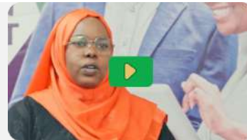
Nawiya Bacar Artist and Author, Comoros Islands