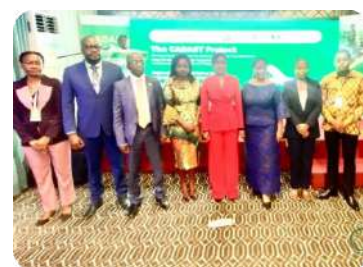
Gabon Media Time