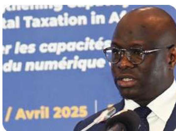
APS (Agence de Presse Sénégalaise)